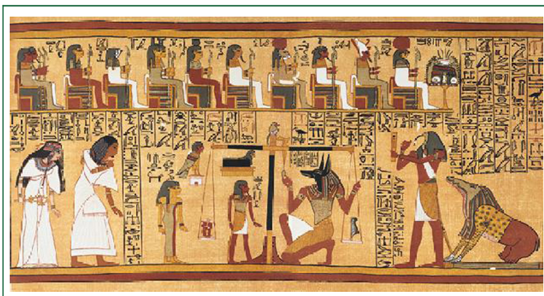
FIGURE 4. The weighing of the heart ceremony, the judgment day of the ancient Egyptian religion. The heart of the deceased is weighed against the Feather of Ma'at, the goddess of truth and justice [86]. In the Papyrus of Ani circa 1200 BCE (public domain), via Wikimedia Commons.

correlated with atherosclerosis [74]. Multiple potential serum correlates with CHD are currently under active investigation. To believe that other measures will not be discovered and found to be correlative and potentially causal for atherosclerosis would seem to be presumptuous. Likely, there is much to be learned.